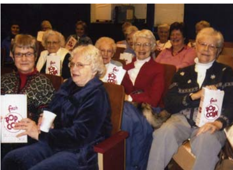
UMW members view a movie about the lost boys of Sudan -- "God Grew Tired of Us."

Lord, during this Lenten season, help me to grow closer in my relationship with you through prayer. Help me to remember to pray when I'm walking or driving, when I'm at work or at school, when I'm happy or sad or frustrated or angry. Help me to remember to "pray without ceasing" (1 Thessalonians 5:17).